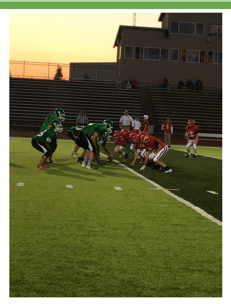
Vikings Offensive Line